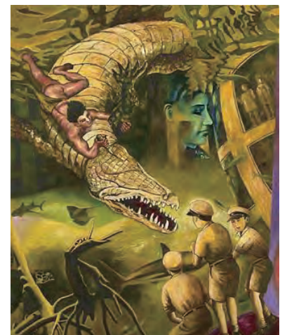
An Incident in the Womb, 27 June (1955)

This marks the first time that Yokoo has ever curated a solo exhibition of his work at a public museum. Yokoo's works are highly self-referential and, as is widely known, many of them are closely linked to memories and experiences from his childhood. In a sense, Yokoo's focus on himself has enabled him to maintain a relationship with the world. Here, Yokoo will make use of his unique perspective to construct an exhibition. In effect, this is a means of confronting himself in a new dimension. What will emerge as a result? Don't miss this ambitious effort that could only be undertaken by a museum dedicated to a single artist.