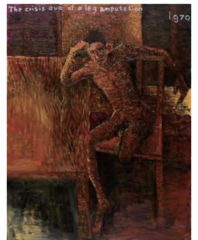
The Crisis Eve of a Leg Amputation (2013)

Yokoo Tadanori is a member of the "fleshly" school of painting. Placing an emphasis on the flesh rather than a concept or spirit, Yokoo strives to listen closely to the unvoiced opinions that issue from the body. Thus, various phenomena related to his own body are of constant interest to him. This exhibition focuses on the period that began in the 1980s, when Yokoo shifted his attention from the spirit world to the body, to the present day as he muses on old age. Likening the museum to a hospital, the exhibition presents a collection of works and documents that are related to Yokoo's flesh, both in real life and the realm of creation.